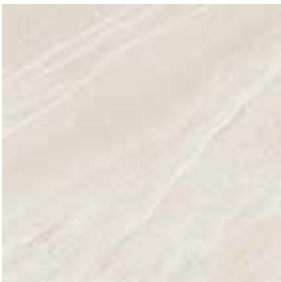
24X24 CROSSOVER CREMA 2CM R11