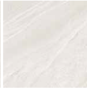
24X24 CROSSOVER WHITE 2CM R11