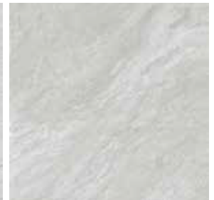
24X24 SANDROCK SILVER 2CM R11