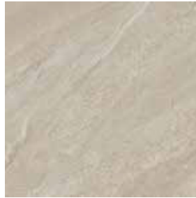
24X24 CROSSOVER BEIGE 2CM R11