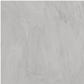
24X24 BLUE STONE STEEL SLATE 2CM R11