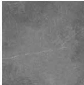
24X24 EPIRO ANTHRACITE 2CM R11