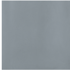
24X24 BLUE STONE STEEL 2CM R11