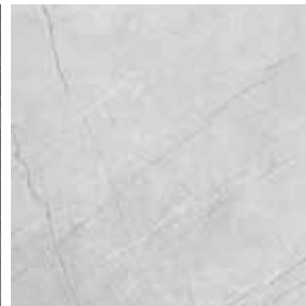
24X24 EPIRO GREY 2CM R11