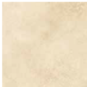
24X24 LIME STONE IVORY 2CM R11