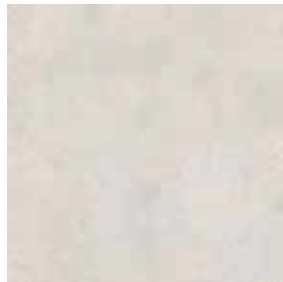
24X24 CLAY WHITE 2CM R11