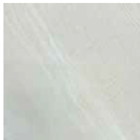
24X24 CANYON CREAM 2CM R11